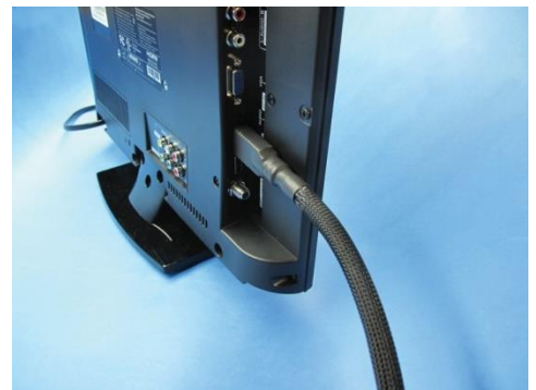
Fig 5: Attaching the Cable

5. Attach the HDMI cable to the TV or Video Screen.