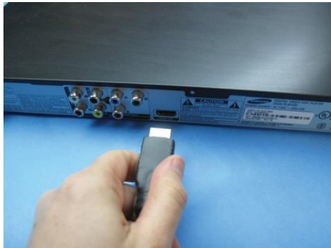
Fig 2: Aligning the Cable

2. Carefully align the filter end of the HDMI cable with the back of the source.