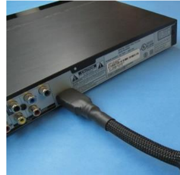
Fig 3: Attaching the Cable

4. Carefully align the output end of the HDMI cable to the TV or Video Screen.