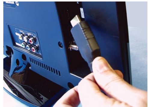
Fig 4: Aligning the Cable

4. Carefully align the output end of the HDMI cable to the TV or Video Screen.